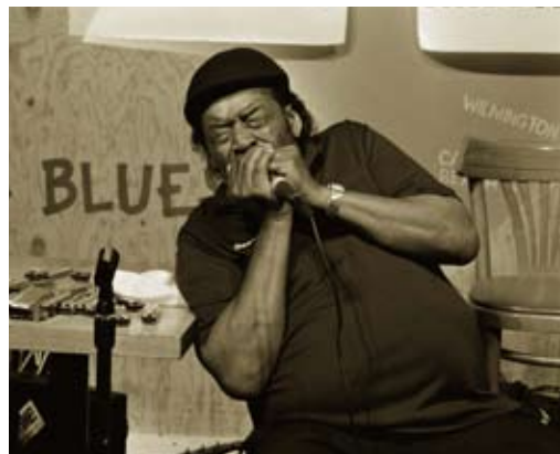
The great blues “harpist” James Cotton throws heart and soul into his harmonica. Cotton is featured in New Harmonies: Celebrating American Roots Music.

The cost to each exhibitor on the tour. The fee covers SITES administrative and organizational expenses that are not provided by federal appropriations or grants. A deposit of 25 percent is required for all exhibitions. All outgoing or prorated shipping costs are additional, unless otherwise stated.