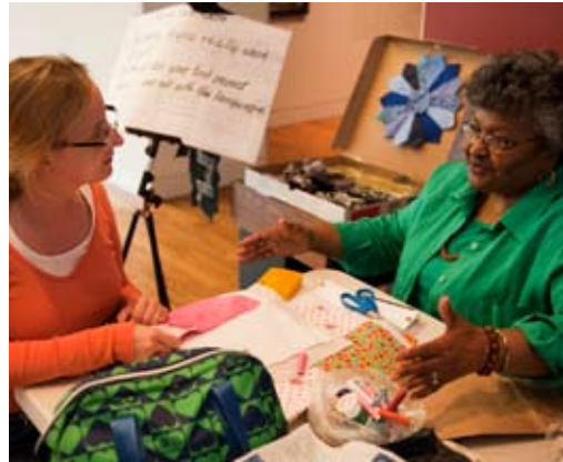
Delaware Art Museum

The Smithsonian Community Grant program is funded by MetLife Foundation .