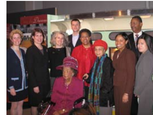
SITES staffers gather around civil rights pioneer Dr. Dorothy Height, activist Myrlie Evers-Williams, and poet Sonia Sanchez, at the opening of Freedom's Sisters , an exhibition that pays tribute to them and 17 other African American women whose work for liberty and equality continues to push aside limitations that constrict Americans.