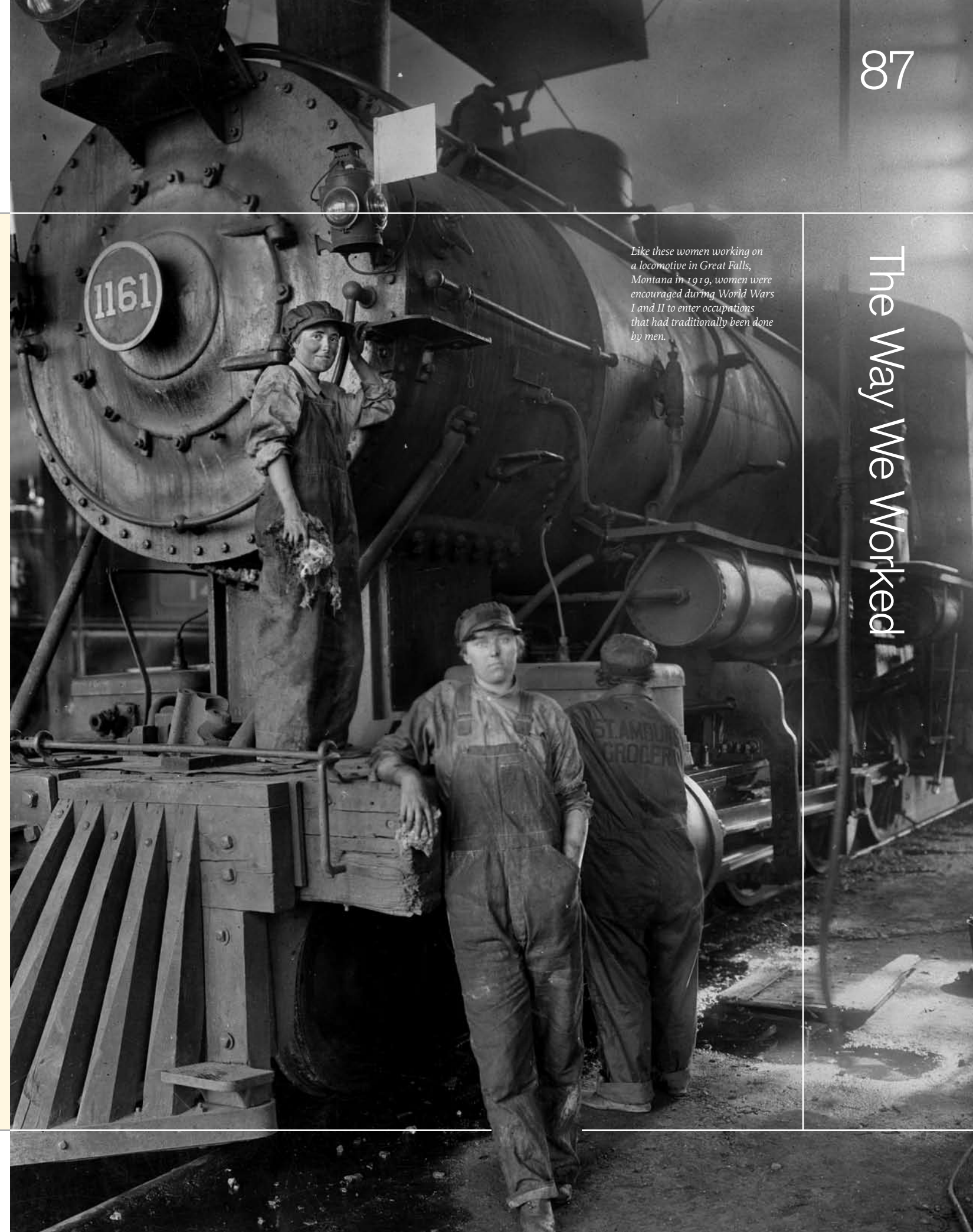
Like these women working on a locomotive in Great Falls, Montana in 1919, women were encouraged during World Wars I and II to enter occupations that had traditionally been done by men.