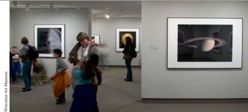
Worcester Art Museum