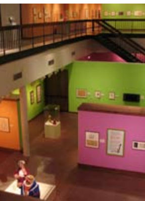
A birds-eye view of Jim Henson's Fantastic World , on display at the Louisiana Art and Science Museum in Baton Rouge.