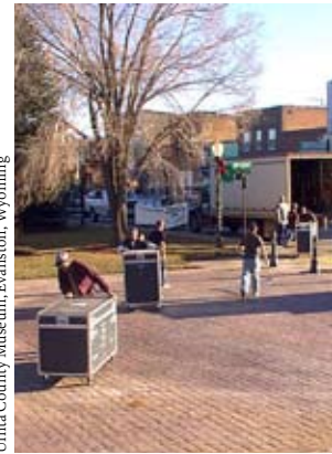
Uinta County Museum, Evanston, Wyoming

We encourage host organizations to seek local support for SITES exhibitions, and we provide guidelines for fundraising and working with national sponsors (as applicable). SITES may request that exhibitors provide certain benefits to national sponsors; details about these benefits