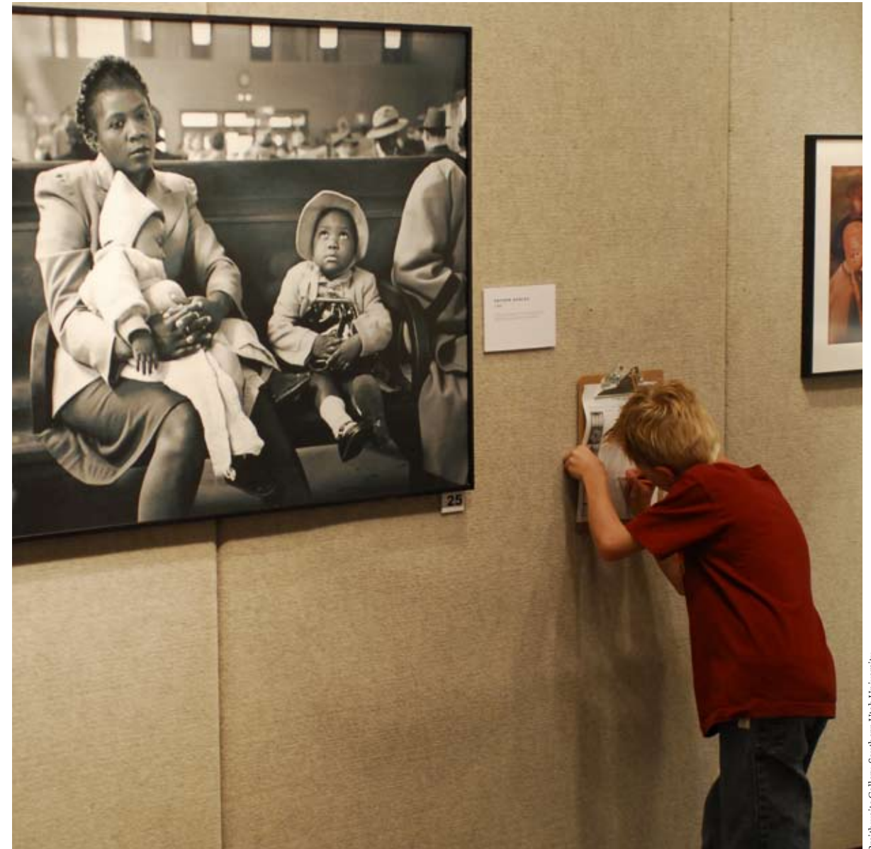
Braithwaite Gallery, Southern Utah University

The Delaware Art Museum jumped at the opportunity to host one of SITES most colorful exhibitions: Ancestry and Innovation: African American Art from the American Folk Art Museum . The organization was awarded a grant for hands-on programs highlighting folk art traditions. With free art activities and expert quilting demonstrations, the museum's Family Day resonated with visitors, who learned about the ongoing contributions of black artists to the kaleidoscope of American folk art.