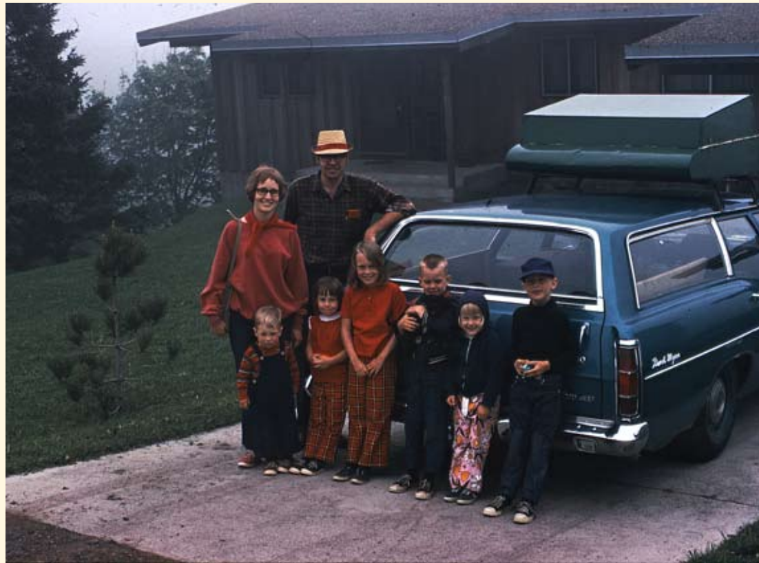
Larson family Opposite: Arthur Rothstein, Library of Congress

The Larson family poses for a photograph before heading out on vacation, June 1970.