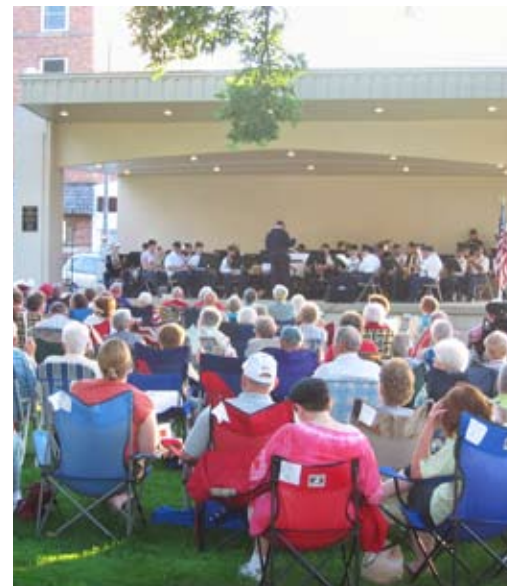
The Platte County Historical Society Museum in Columbus (NE), took advantage of summer weather to host an outdoor concert in conjunction with its showing of New Harmonies, a Museum on Main Street exhibition. The Nebraska Humanities Council has hosted every MoMS exhibition (seven!) in SITES' program, but who's counting?