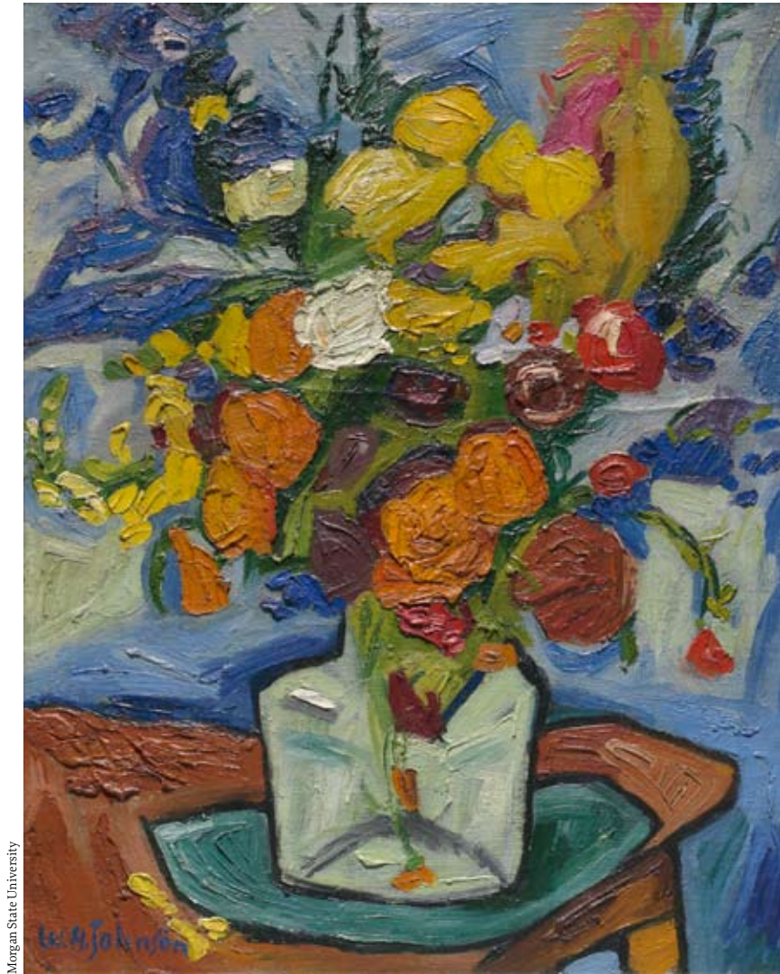
William H. Johnson's Still Life , painted in 1938, shows the artist's remarkable range and diversity of styles. Oil on burlap.