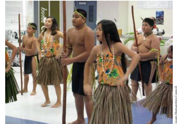
Middle-school students show off their dance moves at the Guam Community College in Barrigada where New Harmonies: Celebrating American Roots Music made one of its four stops on its Museum on Main Street tour of the U.S. territory.