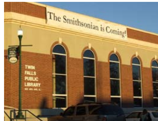
Twin Falls Public Library