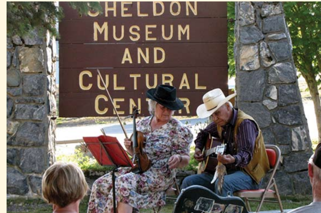
Sheldon Museum and Cultural Center

The Sheldon Museum and Cultural Center in Haines, AK, held a series of performances to complement their showing of New Harmonies. Performers like "Art and Nola" introduced visitors to Alaskan musical traditions.