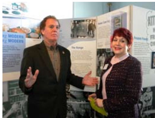
Georgia Humanities Council

Museum on Main Street has been made possible through the generous support of the United States Congress.