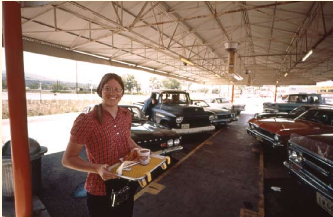
For many young workers, like this woman at a drive-in restaurant in Rifle, Colorado in 1973, a first job provides a taste of paid employment, a chance to build self-confidence and an opportunity to learn how to get along in the workplace.

The Way We Worked is generously supported by the United States Congress.