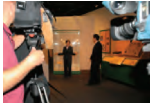
First Lady Laura Bush visited First Ladies: Political Role and Public Image while it was on view at the National Constitution Center in Philadelphia.