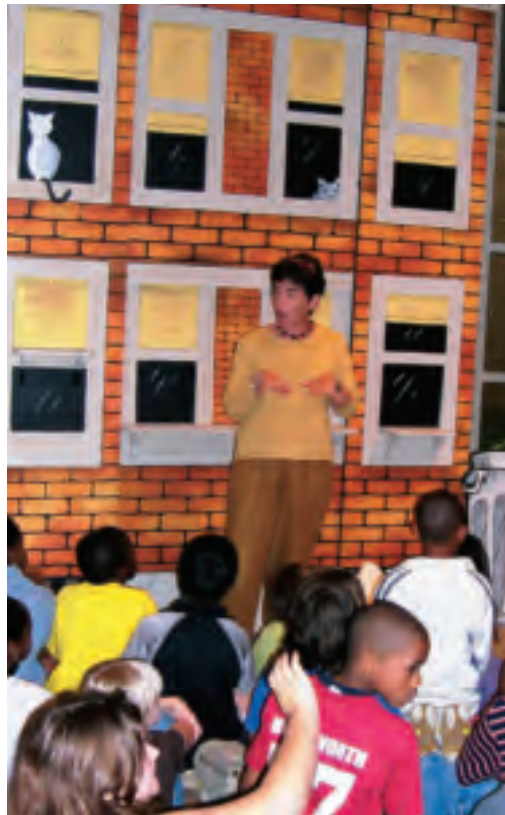
Puppet Play, performed every weekend afternoon that Jim Henson's Fantastic World was on view at the Arkansas Arts Center, drew its own crowd through media exposure and word-of-mouth.

The Smithsonian Community Grant program is funded by MeLife Foundation .