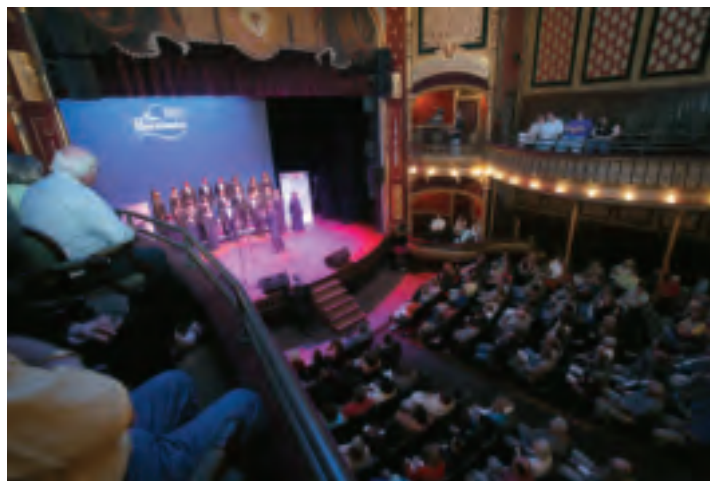
The meticulously restored Opera House at the MSU Riley Center in Meridian, MS, drew more than 1,000 guests to the gala concert launching the statewide Museum on Main Street tour of New Harmonies: Celebrating American Roots Music.

Illinois Humanities Council Indiana Humanities Council Humanities Iowa Kansas Humanities Council Kentucky Humanities Council Louisiana Endowment for the Humanities Maine Humanities Council Maryland Humanities Council Michigan Humanities Council Minnesota Humanities Center Mississippi Humanities Council Missouri Humanities Council Humanities Montana Nebraska Humanities Council Nevada Humanities New Jersey Council for the Humanities New Mexico Humanities Council North Carolina Humanities Council North Dakota Humanities Council Ohio Humanities Council Oklahoma Humanities Council, Inc. Oregon Council for the Humanities South Dakota Humanities Council The Humanities Council South Carolina Humanities Tennessee Texas Historical Commission Utah Humanities Council Virginia Association of Museums Virginia Foundation for the Humanities Humanities Washington West Virginia Humanities Council Wisconsin Humanities Council Wyoming Humanities Council