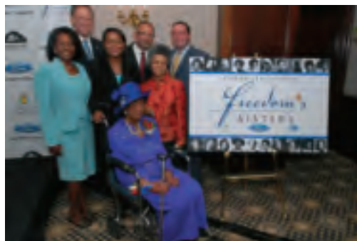
The Washington, DC, press announcement of Freedom's Sisters honored Dr. Dorothy Height and Sonia Sanchez (in purple and in red), shown here with representatives from project sponsor Ford Motor Company Fund, museum partner Cincinnati Museum Center, and SITES.