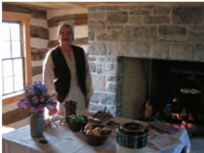
Cooking demonstrations of all food types and time periods highlight local programs for Key Ingredients: America by Food, a Museum on Main Street exhibition. The Washington County Rural Heritage Museum in Boonsboro kicked off the Maryland tour by taking visitors back to a colonial kitchen.