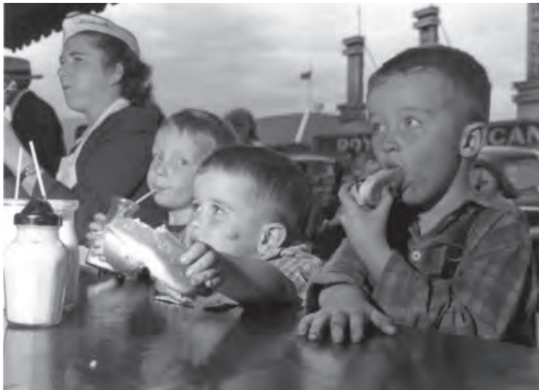
Minnesota Historical Society

Key Ingredients is generously supported by the United States Congress.