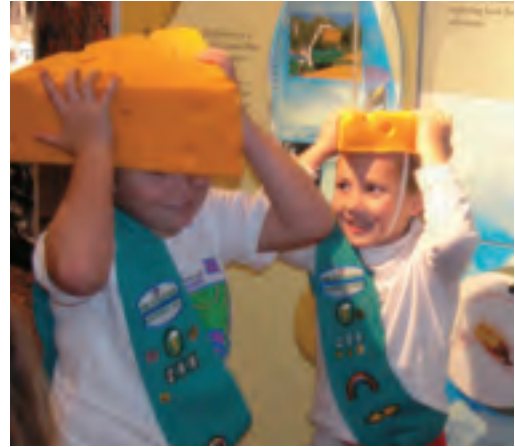
Girl Scouts try on Wisconsin cheesehead hats while visiting Key Ingredients at Delta State University in Cleveland, MS.

Museum on Main Street exhibitions focus on broad topics and give host museums the opportunity, with support from state humanities councils, to create their own educational programs, activities, and exhibitions that center on their local culture and heritage. Consisting of freestanding units and objects, exhibitions are specifically designed to address the space and staffing constraints of small cultural institutions. Exhibition units travel in easy-to-handle wheeled crates and can be assembled and disassembled with minimal effort. Program planning and installation workshops, in addition to exhibition support materials, are provided to venues hosting the exhibitions.