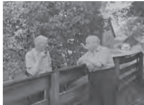
John Vachon. Library of Congress

Between Fences is generously supported by the United States Congress.