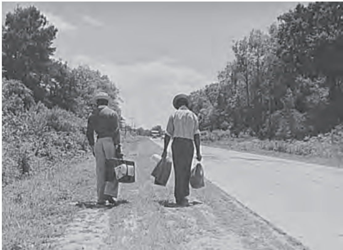
Two migratory workers, traveling from farm to farm during potato season, walk along a North Carolina road in 1940.