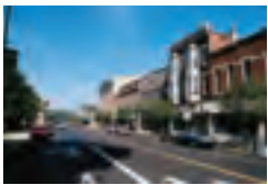
A "main street" in rural Ohio

The response from small-town America has been overwhelming: new and reinvigorated museums, libraries, and historical societies; surging attendance; and a host of enriching cultural experiences in communities across the nation.