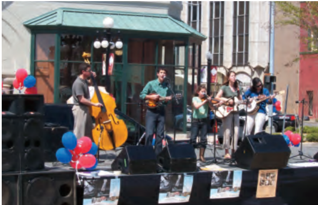
Many host communities for New Harmonies invite local musicians to perform popular varieties of roots music. Meridian, MS, kicked off the state's tour of the exhibition with an outdoor performance in a local park.

Opposite: New Harmonies examines the great diversity of American music and how we use it to celebrate our cultural heritage. This image from the exhibition shows a group of Native American drummers performing at a National Museum of the American Indian powwow in 2005.