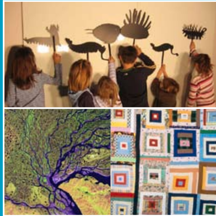
Puppets based on Cambrian life come alive 500 million years later; satellite imagery finds beauty in Earth’s geography; and patchwork quilts capture memories and artistry.