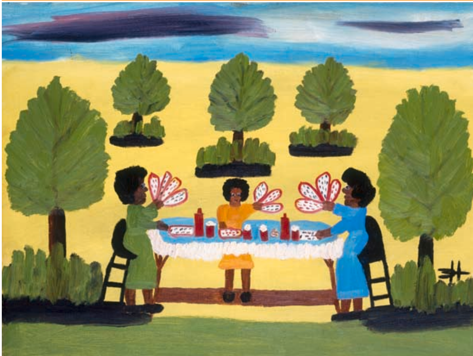
African American folk art treasures will begin touring the U.S. in February 2008 thanks to the generous support of MetLife Foundation.